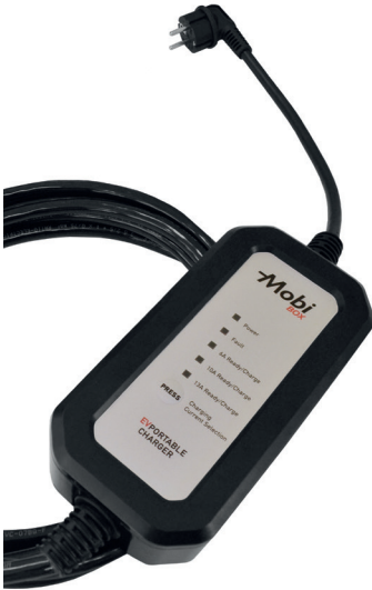
Mobi Box front panel Schuko version